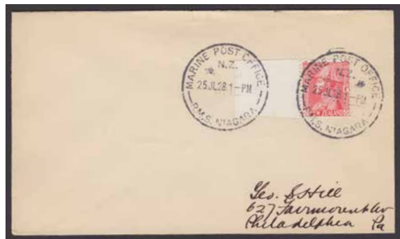
179(h) 1928 RMS Niagara (p. 15)

The CP Newsletter is a confidential source of information for philatelists and collectors. Published by Campbell Paterson, Auckland New Zealand. ISSN 1172-0166