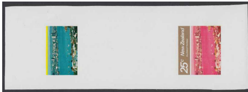
Fournier Archive Proof 1980 Scenic 25c Auckland Harbour lot 1(c)