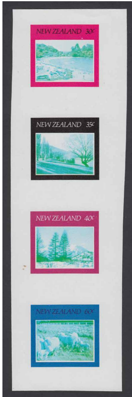
Fournier Archive Proofs 1982 Scenic Four Seasons lot 1(e)