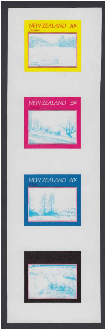
Fournier Archive Proofs 1982 Scenic Four Seasons lot 1(d)