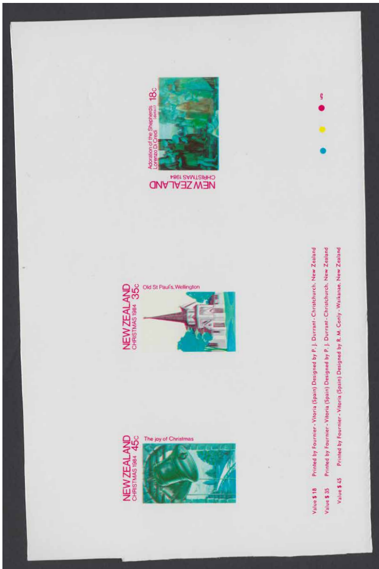
Fournier Archive Proof 1984 Christmas lot 1(f)

The CP Newsletter is a confidential source of information for philatelists and collectors. Published by Campbell Paterson, Auckland New Zealand. ISSN 1172-0166