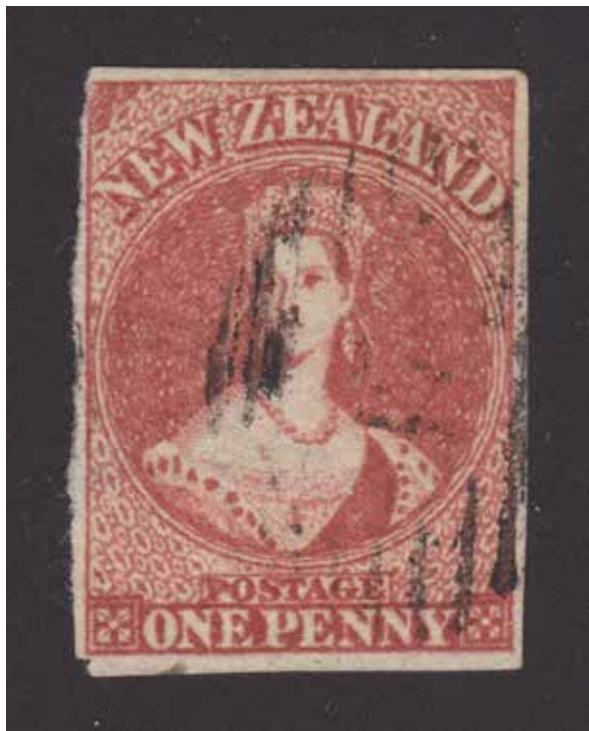
1855 1d London Print Deep Carmine-Red CP A1a (SG1) P.O.A. (p.12)