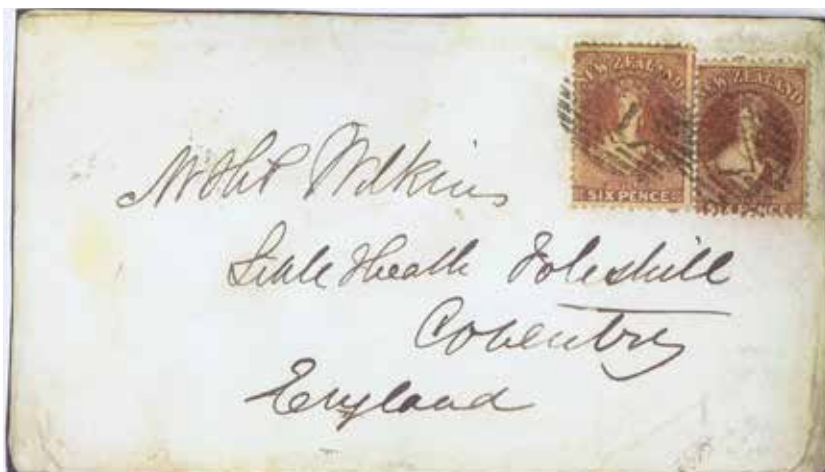
325(d) 1870 June 6 2 x A5h 6d red-brown (p.9)