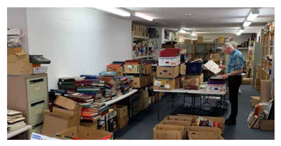
CP's David Holmes midway though the ruthless office clear out.

So the lesson here, like always, is to make sure you look after your collection – big or small - so it is worth something when it comes time to sell. The market is strong and the future bright for material that has been well looked after.