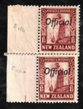
SG 0116a 1936 1 1/2d Official unhinged mint

1 of 4 recorded CP LO3a Catalogue $50,000.00