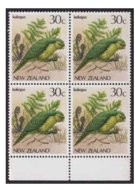
Normal Issued Stamp